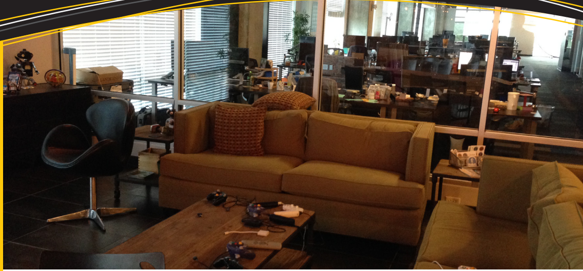
Envy labs, in the GAI building in Orlando.