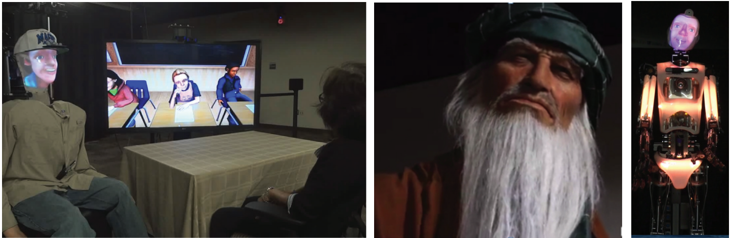
Virtual and robotic with virtual face; animatronic; fully robotic with virtual face