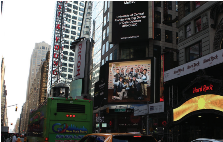
News of the National Championship victory quickly spread across the country. The UCF CCDC Team's photo was prominently displayed on an electronic billboard in New York City's Times Square on Monday, April 28, 2014.

break into the teams' networks and systems to steal customer data or confidential documents, deface the teams' website, change passwords and take control of the teams' servers, or delete files or entire servers. Teams lose points if (and when) their systems are breached by the Red Team. A team can recover some of the points lost to the Red Team if they are able to promptly identify the breach by the Red Team, take steps to contain/recover the damage, and promptly thoroughly document the breach, identify what information was compromised, and what steps they have taken to patch the vulnerability and recover from the breach.