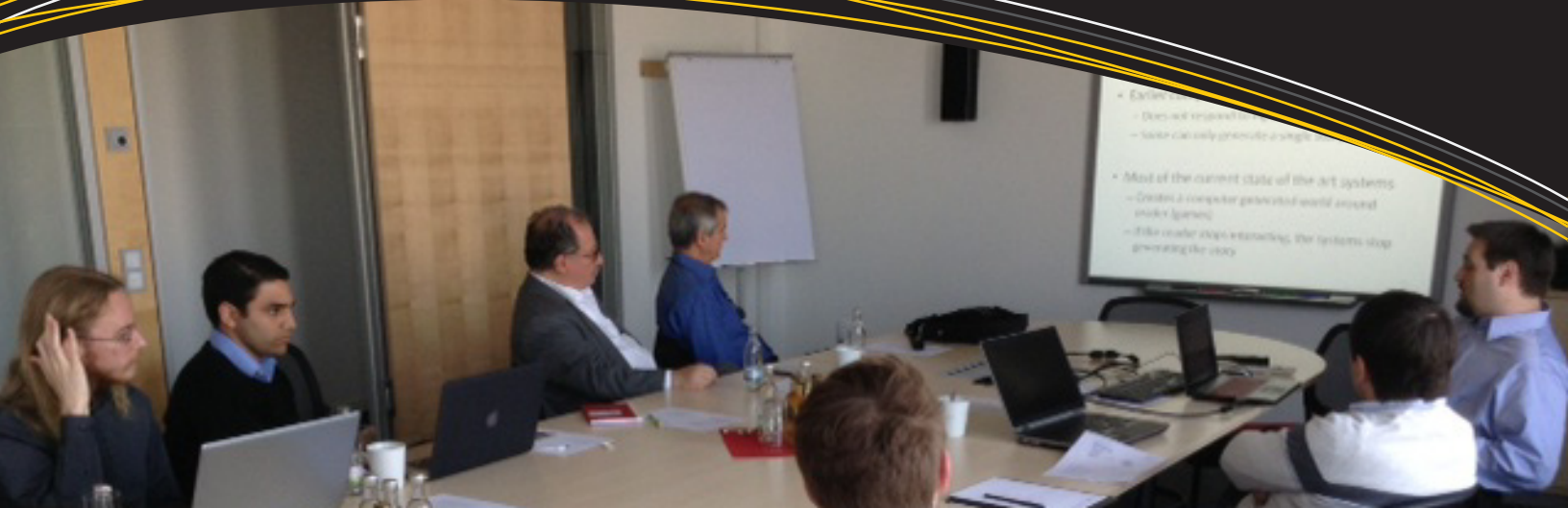
The UCF CS team presents their research to the Fraunhofer Institute Department of Media Technologies.