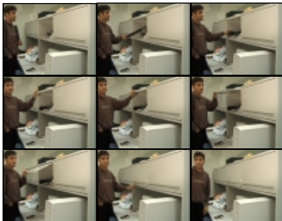
Figure 5. Action 3: put down the object in cabinet, then close the door.