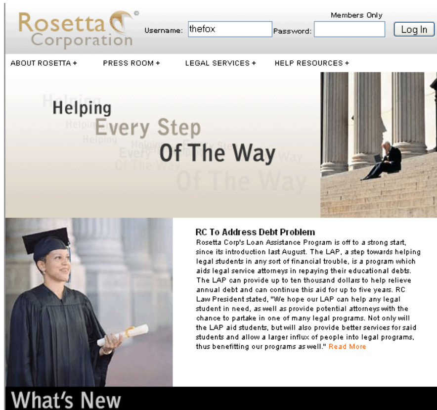
Figure 1: Web-Site for Fictitious "Rosetta Corporation"