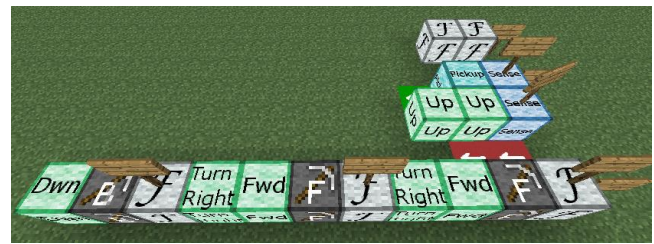
Figure 5. A program created by a player using CodeBlocks in a public Server. The program mines resources, a task often done by hand in Minecraft.

We released and tracked CodeBlock's use by other Minecraft servers to determine what they used it for. We wanted to gauge Minecraft player interest, their use of the plugin, whether they could use it effectively and their opinions. It was released for 66 days. It was downloaded 319 times, and installed on 6 online servers. 27 distinct programs were created, and robots executed 133 programs in total. An example of a program created by a Minecraft player can be seen in Figure 5. On our website, users made comments such as "nice work", one stating "Absolutely Brilliant! Minecraft needs more original mods like this." One of the users mentioned that they had previous programming experience with Java, Squeak [8] and Scratch [17].