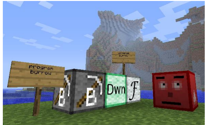
Figure 1. We extended the commercial video game Minecraft with our robot programming language, CodeBlocks. It was used to teach programming concepts and generate interest in programming.

In the past decade, the number of students interested in computer science has been decreasing [6]. Students are rarely exposed to programming in elementary and middle school and often lack engaging learning experiences. The potential for collaborative constructivist learning, using games in an informal learning approach to address learner involvement, is promising, but often elusive. Learners quickly recognize learning games for what they typically are: shallow, with poor stories, bad gameplay, and artistically lacking scenery.