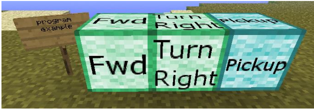
Figure 2. A simple program named “example” instructs the robot to move forward, turn right and pick up a block. The block-based instructions fit the style of Minecraft’s gameplay.