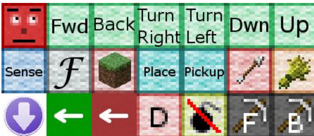
Figure 3. The texture pack demonstrates the programming statement of each block. Row 1: Robot, Move Forward, Move Backward, Rotate 90° Left, Rotate 90° Right, Move Vertically Down, Move Vertically Up; Row 2: Sense, Function Call, Build, Place Block, Pickup Block, Shoot Arrow, Harvest; Row 3: Current Action Indicator, True Branch Marker, False Branch Marker, Destroy, Defuse, Mine in Front, Mine Below

A few other design considerations were made. We were concerned with the ability for players to trace program execution. We tried different approaches and settled on stacking a block on top of each instruction when it was being executed. As the execution traversed the main program and recursed down functions, players could watch each step by following the moving, extra block. To slow down or speed up execution for debugging or other purposes, a player could place a sign on top of the start block to set the speed of execution. It defaulted to one block per second.