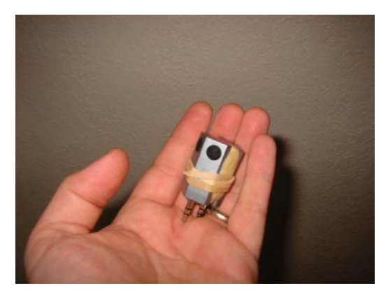
Figure 3: Miniature homemade surround microphone

and tend to be higher quality in performance than typical mobile recording devices. Each of the options listed above have distinct advantages and disadvantages. Where mobility is of the utmost importance, Mini-disc, and flash drive devices are the best option. Where high resolution recording with many inputs is the most important quality, firewire recording devices will typically be the right solution.