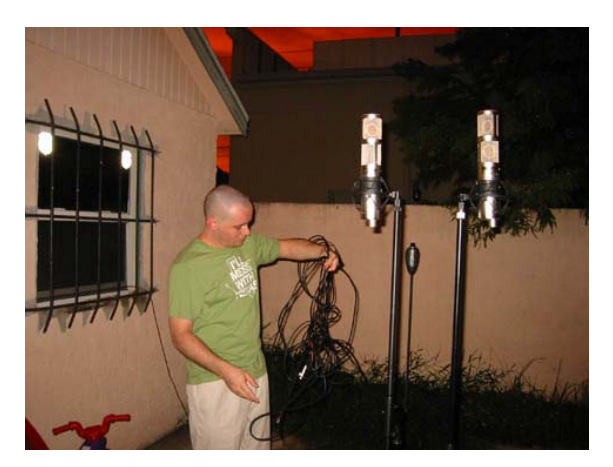
Figure 5: Back-to-back stereo