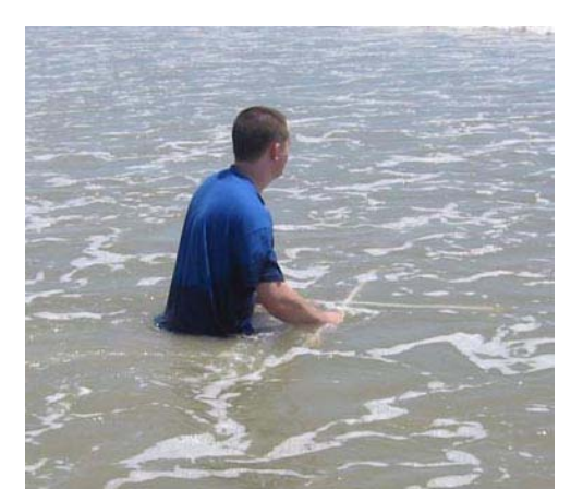
Figure 1: Surround Hydrophone Capture

Hydrophones are hermetically sealed transducers designed specifically for underwater or damp capture. When recording the audio for MR SeaCreatures (an interactive learning game for the Orlando Science Center) it was important to create both a realistic and immersive ambient track. To achieve this objective, a hydrophone array was used to capture the ebb and flow of the turbulent shore break at Cocoa Beach (see Figure 1 ). The end result was a highly detailed and textured soundtrack which post-experience interviews showed to be effective in creating a sense of place within the underwater experience.