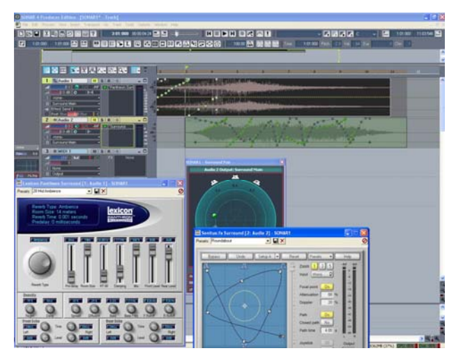
Figure 4: Surround mixing in Sonar 4 Producer Edition

The process of synthesizing, mixing, and mastering is when all the assets are gathered together and mixed, when appropriate, with effects libraries and synthesized sounds. This stage most closely resembles that of standard audio production in that industry standard tools are typically used such as DAWs like Sonar, ProTools, Cubase, etc. Figure 4 is a screen shot of a surround mix using Sonar 4 Producer Edition. In this example there are two sounds, the top sound is a helicopter taken from Lucas Sound Effects Libraries, while the bottom sound is a mono capture of wind. This kind of production is most important for the creation of prescripted effects that have a predetermined spatial image (as opposed to real-time spatialized sounds during an interactive scenario).