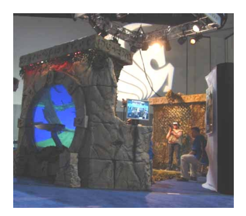
Figure 6: MR TimePortal at SIGGRAPH '03

For the specific demands of a highly dynamic and immersive mixed reality simulation, it became clear that a system must be built either on top of an existing API or from scratch. Some of our early attempts involved the use of the Java Media Framework (JMF) which, while providing dynamic cueing, did not support multi-channel output, spatialization, and channel control among many other things (Hughes, Stapleton, Micikevicius, Hughes, Malo & O'Connor, 2004)