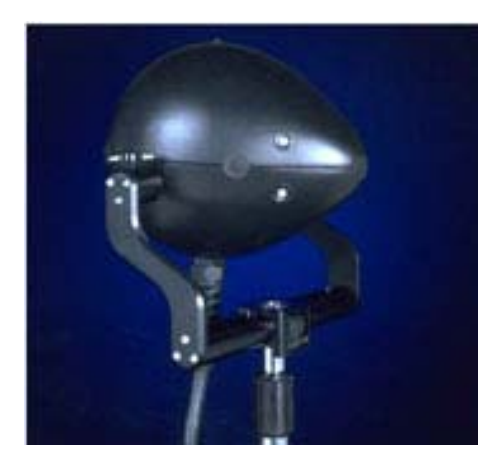
Figure 2: Holophone 7.1 microphone