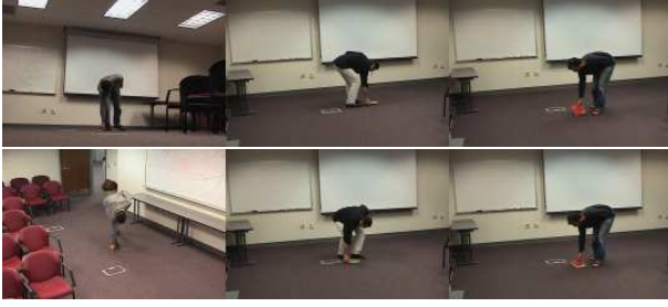
Figure 2. Frames corresponding to ‘Picking Up’ in six sequences. The top left frame corresponds to the example sequence, the rest are the tested sequences. In each sequence, the actors are in markedly different orientations with respect to the camera.

sets describing two actors if they are performing the same action.