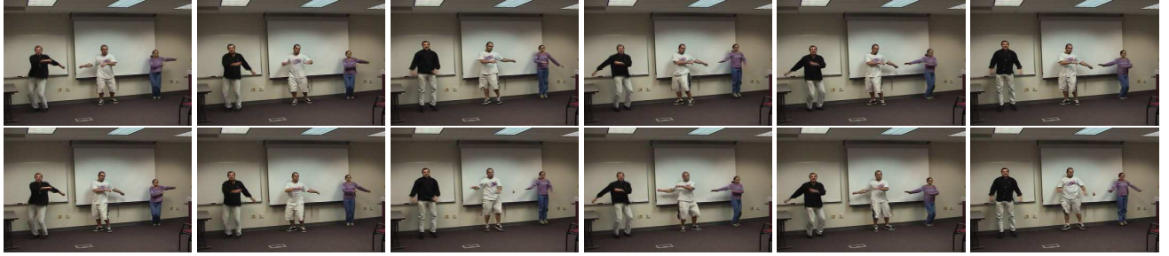
Figure 3. Following the leader. The top row shows six frames before synchronization. Notice the difference in postures of each actor in a single view. The bottom row shows corresponding frames (to the top row) from the rendered sequence after synchronization.