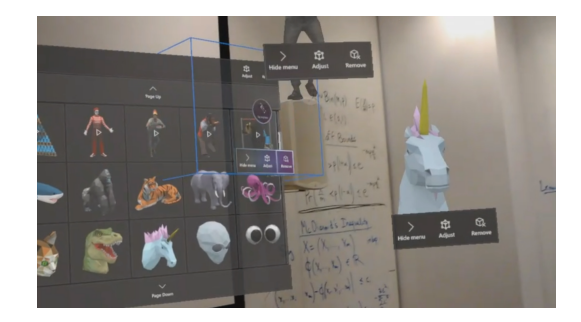
Fig. 1: A first-person view of virtual objects, or "holograms", as seen through the HoloLens head mounted display, including 2D menus and 3D objects.

1) Problem Identification: We identify the fundamental need—largely unaddressed in prior work—to consider security, privacy, and safety for emerging single- and