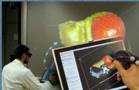
The Eye of Ra hybrid interface, combining 2D and 3D interaction.