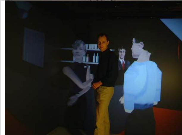
Figure 2b – When the projectors are on the person may be transported into a different world, here interacting with virtual characters in a party scenario.