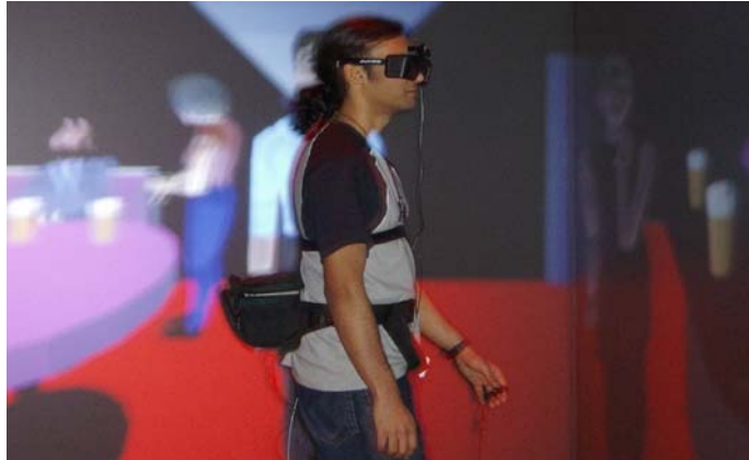
Figure 3 |The left pane shows a participant wearing a head-mounted display. This ideally blocks out all surrounding light. There are two images displayed, one for the left eye and the other for the right eye. Each image cannot be seen at all by the opposing eye. The head-mounted display position and orientation is tracked, and the computer updates the image according to perspective projections from the point of view of each eye.

The right pane shows a participant in a Cave-like environment. He is wearing 3D shutter glasses and also physiological monitoring equipment so that real-time read-outs of his EKG, GSR and respiration are available. The background scene shows a virtual party which has been used recently in a study of social phobia.