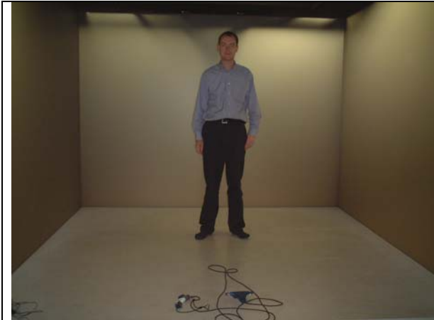
Figure 2a – This shows a person in the ReaCTor Cave-like system, with all the projectors off.