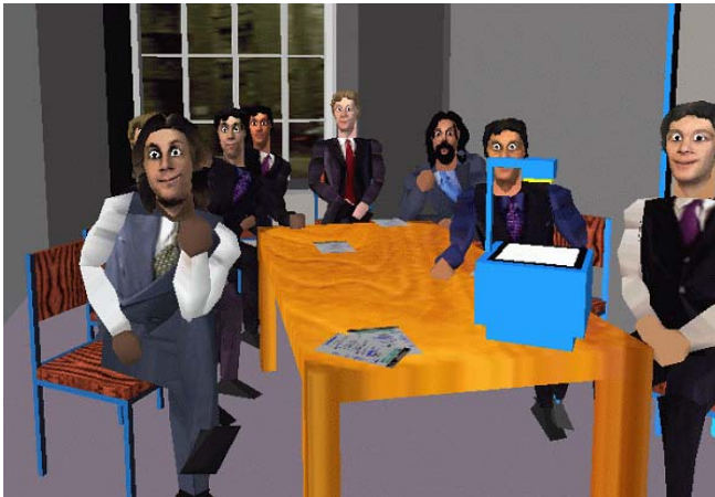
Figure 5a | A snapshot of the positive audience