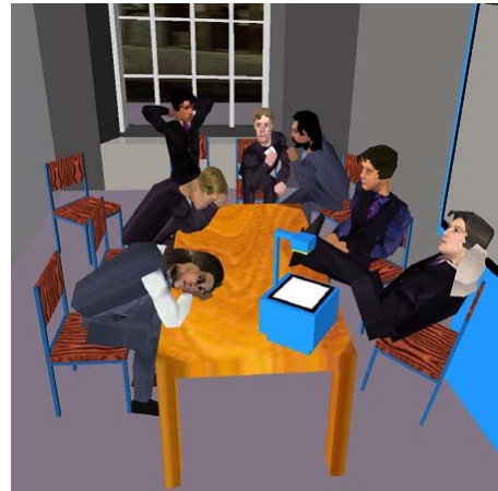
Figure 5b | A snapshot of the negative audience

Virtual environment representing a seminar audience. Although the characters certainly do not look realistically human their behaviour has been modelled on observations from real meetings, though greatly exaggerated – both positively and negatively. In these studies the subjects are asked to give short talks to the virtual audience, that could have a positive, negative or neutral attitude towards the speaker. A response to the audience similar to the one that the same person would have to a real audience was subsequently evaluated as a high presence in the virtual environment. The testimonies shown below illustrate that the responses to the virtual characters went above all rational considerations of what is real, along with the physiological responses measured in the subjects illustrated the fact that people responded similarly to a real environment.