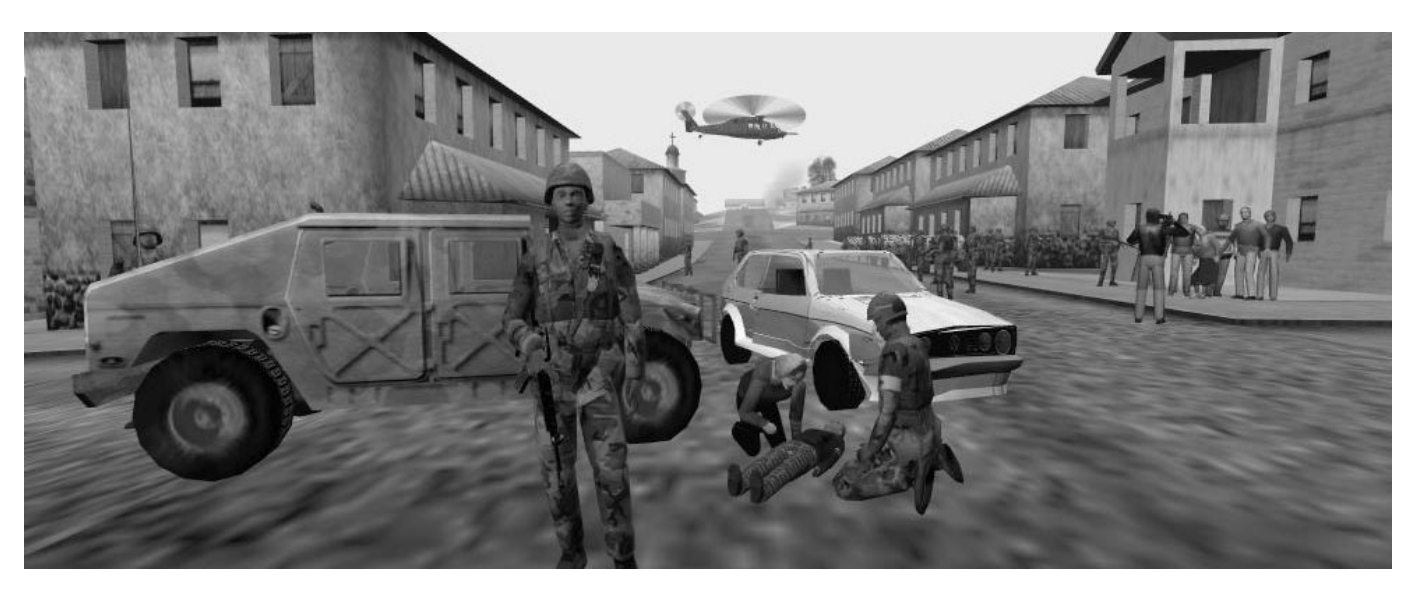
Figure 1: Virtual Bosnian village

perienced a flash of insight in our research that leaves us with intense feelings of joy, only to be crestfallen seconds later by the realization of some crucial flaw. Emotions clearly have a strong influence over our decision-making abilities as well (Damasio 1994; Sloman, 1987).