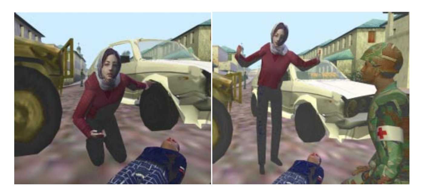
Figure 4: Subdued and angry variants of imploring the lieutenant

tress and anxiety. She transitions back to body focus, which is articulated physically through visible and audible weeping.