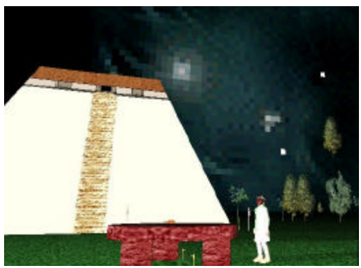
Figure 2. Lida at the altar in ancient Caracol.

The students designed the Caracol world by storyboarding and scripting the action, while examining maps provided by the archaeologists. A large scale map measuring 16 feet by 18 feet was laid out on the floor of the lab using electrical tape, and used for 'blocking' – planning the initial positions of the avatars and of the principal activities. The three episodes used different VRML models, built by three different teams.