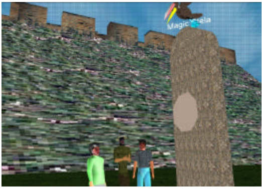
Figure 3. The Stela before the modern ruins.