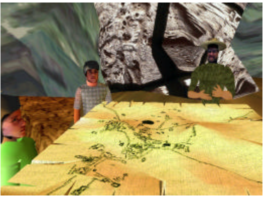
Figure 4. Examining a map in the cave.