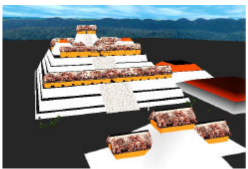
Figure 1. Caana, the great pyramid of Caracol

The Caracol Time Travel story incorporates elements of several Maya myths, together with a substantial amount of new dramatic material. The ancient queen Rainbow sacrificed her jade amulet so that Caracol would win the climactic battle with the city/state of Tikal; but this doomed her soul to exile forever. The archaeology students (guests) learn her story while exploring the ruins during three interactive episodes, and reassemble the amulet to free her soul for its journey to the underworld. Figures 1 through 5 depict some scenes from the adventure.